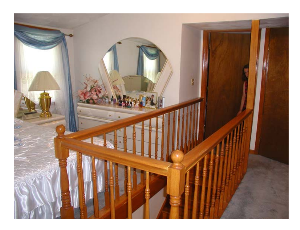
Internal Stairway, Observed from the Third Floor