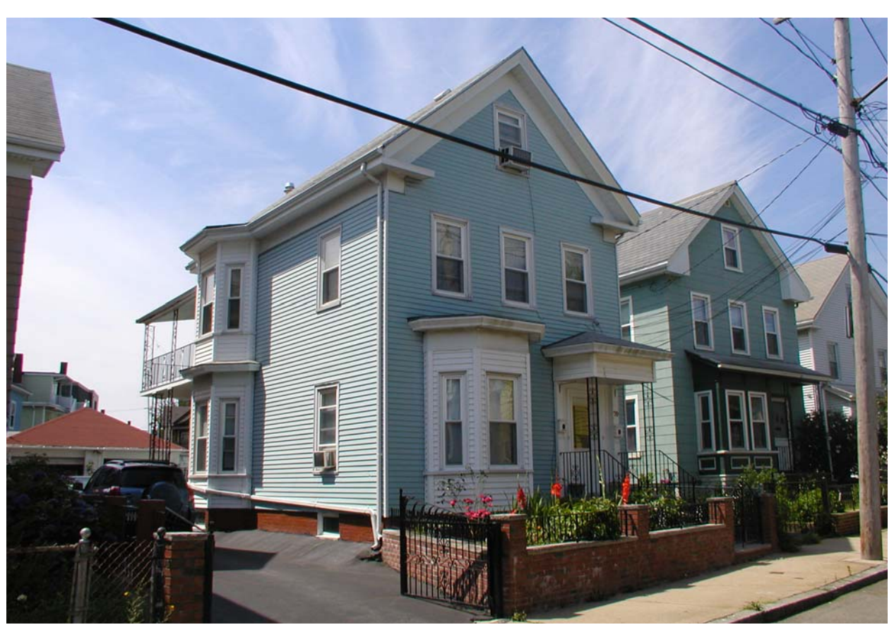
Existing Conditions: Exterior (Above)