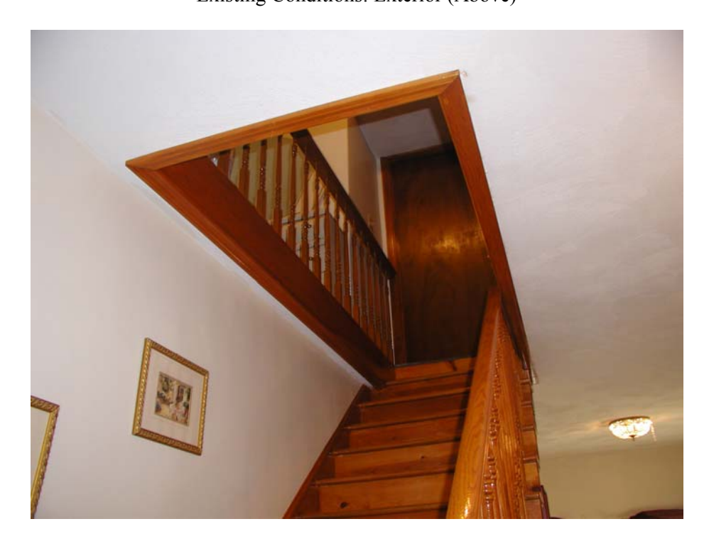
Internal Stairway Leading Up to the Third Floor